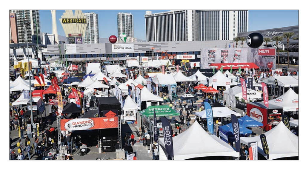
Familiar Las Vegas landmarks can be seen in the background of the outdoor exhibits at the 2017 World of Concrete.