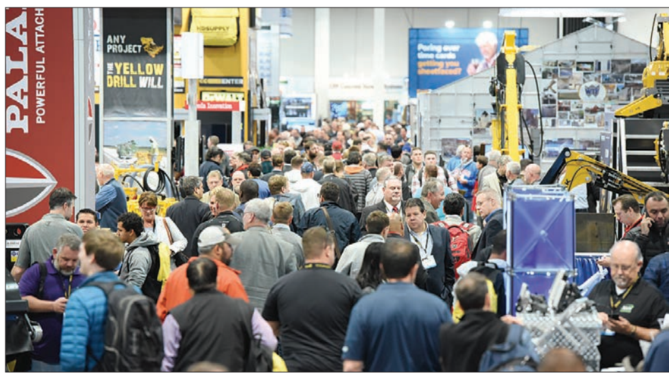
Crowds line the booths at the 2017 World of Concrete.