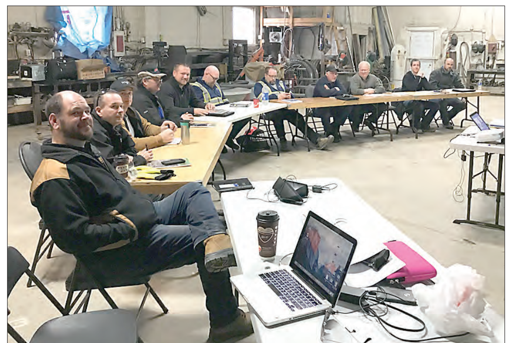
Field Testing Certification and Workshop attracted a lot of participants. Thanks to Quality Concrete for hosting the event.