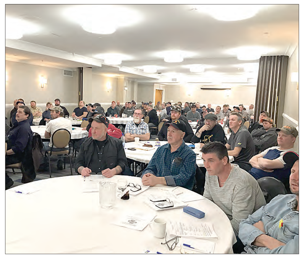
Halifax was the scene for the ACA Concrete Pump Operators Safety Workshop on March 24, during the same time another course, on CDP certification, was underway in Moncton.

'While there will definitely be some growing pains to be worked out, employers must be proactive and begin to plan now," Bates says.