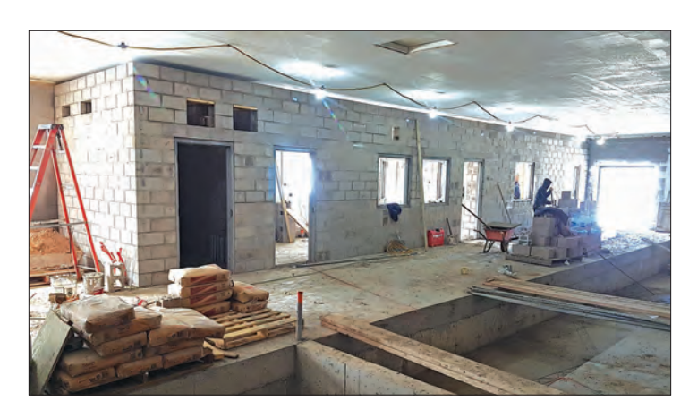
The new water treatment facility will include pressure zones to produce good water pressure throughout the town's higher and lower elevations.