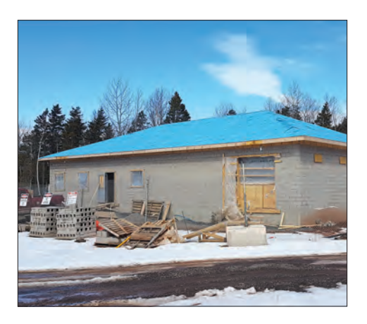
The exterior of Pictou's new water treatment plant is mostly complete while work continues inside.

'The job went very well," says Dave Lemmon, the batch plant operator at the