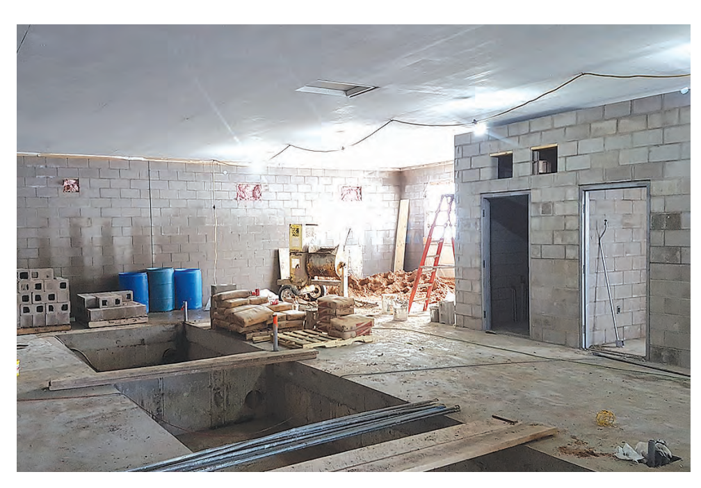
Pictou's new water treatment facility is currently under construction, but expected to be finished by Sept. 1.

The project costs $5 million and includes pressure zones to produce good water pressure throughout the town's higher and lower elevations. Two-thirds of the cost was from federal and provincial sources and the town has financed